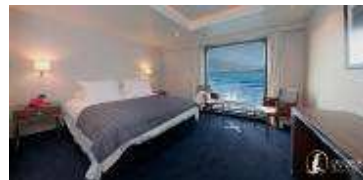
AAA Superior Cabin