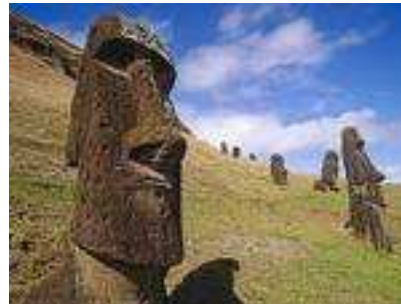
Rano Raraku Quarry