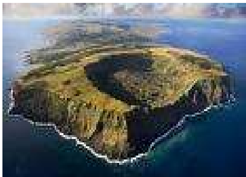
Rano Kau Volcano