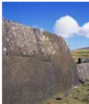
Ahu Vinapu stonemasonry